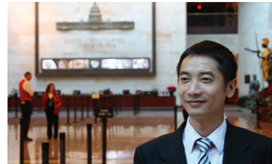
Judge Jiang Heping at the 2012 National Asian Bureau Rising Leaders visit to Washington D.C.

Notwithstanding these developments, traditional mediation is deep-rooted; people commonly accept pro bono and didactic mediation services. It is accordingly much more difficult to enact a modern mediation system than to make mediation acceptable. There is a long way to go before the transition from the traditional to the modern will be accomplished, but no matter how difficult, ADR in China will continue to move forward. ■