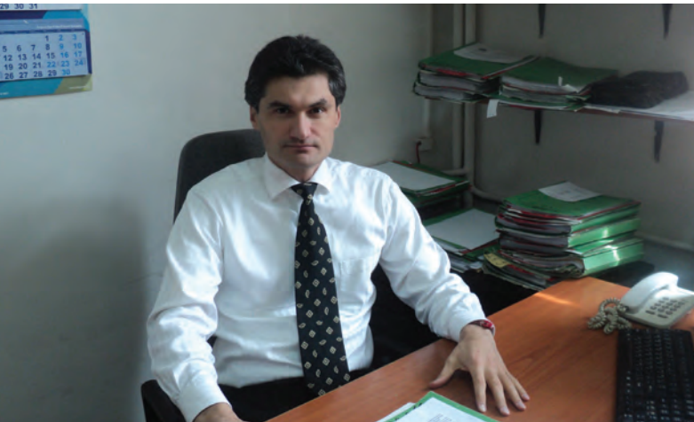
Judge Evgeni Georgiev at his office at the Regional Court of Sophia, Bulgaria.

The other four judges liked the result. Their only concerns were (1) having the same judge hearing the case doing the evaluation might influence the defendants in deciding how to proceed and (2) questions about the impartiality of the judge this could raise. The judges decided, therefore, that the judge conducting the mass evaluation would not be the judge hearing the cases being evaluated.