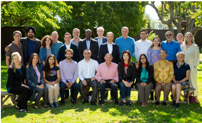
2018 Class of Weinstein JAMS Fellows, JAMS Foundation Members, alumni mentors, and invited guests.

You can't help but notice the collaboration and admiration when you walk into a room filled with Weinstein JAMS Fellows. The 10th class of Fellows landed in the U.S. last fall and kicked off their journeys in San Francisco at the JAMS Resolution Center, which has been a hub for every class of Fellows that has come before them. The excitement and promise of what's to come is in the air and you can feel it. The tone of the conversations is serious, yet eager, friendly and open. This is how it begins each year when a group of legal professionals from around the world convene with a common goal and common mission—to advance alternative dispute resolution (ADR).